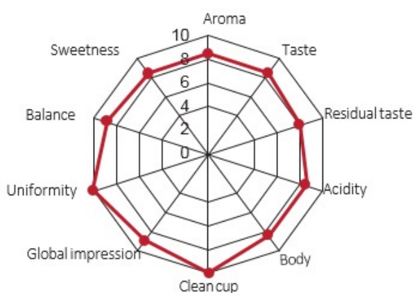
Cup profile Finca El Paraíso